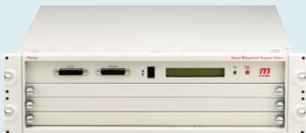
Smart Ringswitch™ Express Select