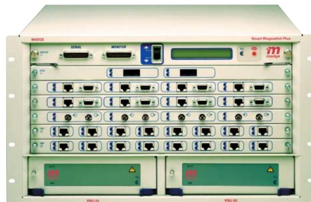
Smart Ringswitch Plus™

The Smart Ringswitch Plus offers a 6-slot modular platform that supports up to 36 UTP/STP or fiber Token Ring switch ports and speeds of 16/4 or 100 Mbps. The addition of the Third Layer Services (TLS) module provides support for layer 3 functionality for IP protocol and enhanced Active Broadcast Control™ (ABC) IP frame filtering within the switch. With support for transparent and source routed environments, the Smart Ringswitch Plus integrates easily into any Token Ring network.